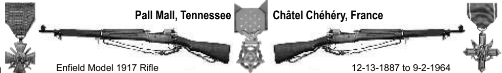
Enfield Model 1917 Rifle